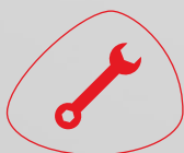
Simple to Install