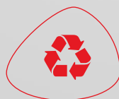
100% Recycled Material