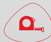
Configurable to any length