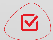
400mm Culvert is Transit NZ F/2 Approved